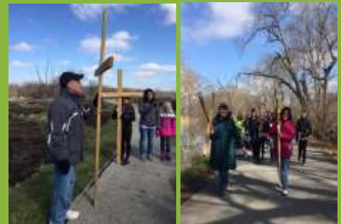
Good Friday Hike - I&M Canal