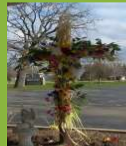
Our Living Cross- Easter Sunday